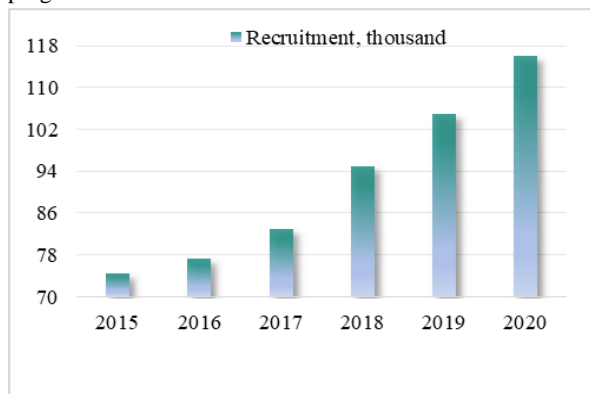
Figure 3 Chinese PhD recruitment rank in 2015~2020. [4]

The Chinese PhD graduate in 2015~2020 will indicate 75,000~115,000 accordingly in terms of Figure 3 whose variation provide 40,000 expressed the middle enhancing status. The y-y value could attain 10.4% in 2020 with middle progress.