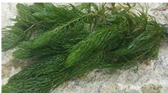
Figure 1: Ceratophyllum Demersum

Aquatic macrophytes for the basis of aquatic ecosystems and play fundamental roles in nutrient cycling (Abu, T., 2017). Aquatic macrophytes may be classified as emergent (e.g. cattails), free-floating (e.g. water lilies), or submerged macrophytes (e.g. coontail-ceratophyllum demersum) (Oyedeji and Abowei, 2012). Ceratophyllum demersum , also called coontail or hornwort, occurs in quiet and slow-flowing waters (Figure 1). Ceratophyllum demersum has been widely used as bioindicators in heavy metals pollution, radioactive indicators, and genetic engineering (Shabnam and Saeed, 2016). It is also used as a source of food for some livestock, poultry, and fish (Abu, T., 2017).