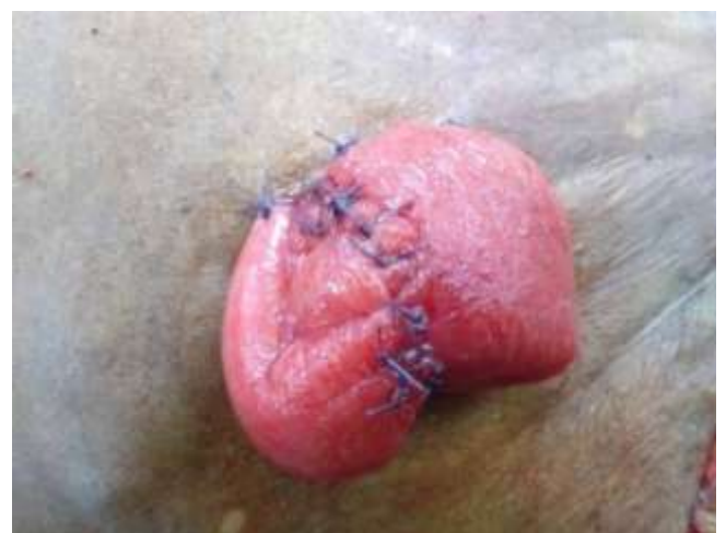
Figure IV: Extra-abdominal anastomosis