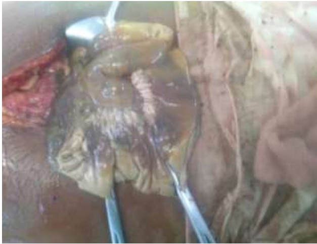
Figure I: Gross gangrene of jejunum-ileum due to superior mesentery artery thrombosis.

lower anastomoses 11-13 . Anastomotic has been reported to increase the mortality rate from 1.6% to 12% 14 . Loop ileostomy closure is associated with a morbidity of 17.3% and mortality of 0.1-4% 15-17 .