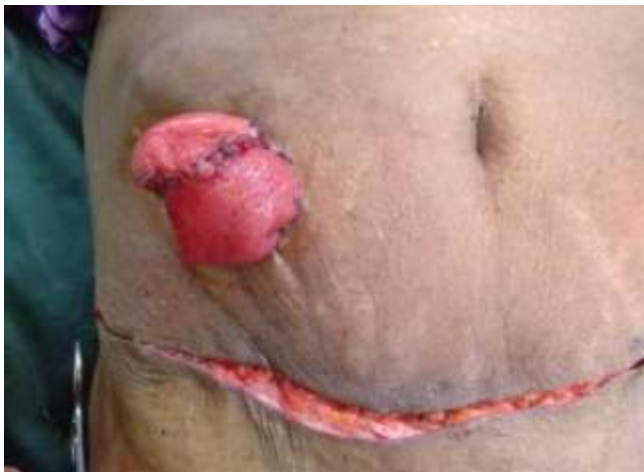
Figure V: Extra-abdominal anastomosis