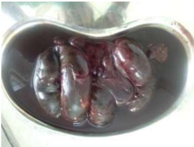
Figure II: Gross gangrene of jejunum-ileum due to superior mesentery artery thrombosis.

There are so many clinical situations (figure I & II), where it is a great challenge for the surgeons to perform intestinal anastomosis or exteriorization of the intestine (problem of anastomosis leakage, short bowel syndrome, high output fistula, inadequate intestinal length, etc.). In such circumstances, extra-abdominal intestinal anastomosis is a possible solution. The main aim of this research is to describe the surgical technique and to assess the outcome and different aspects of the newly proposed method of “extra-abdominal intestinal anastomosis”.