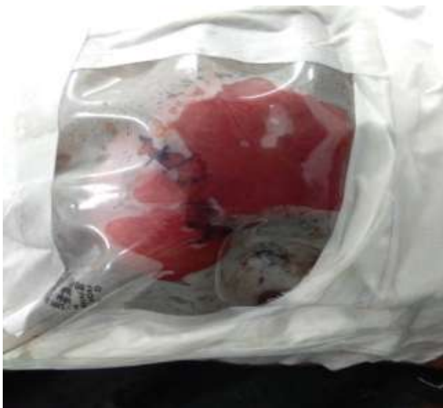
Figure VII: Sterile covering with sterile extra-abdominal drainage.