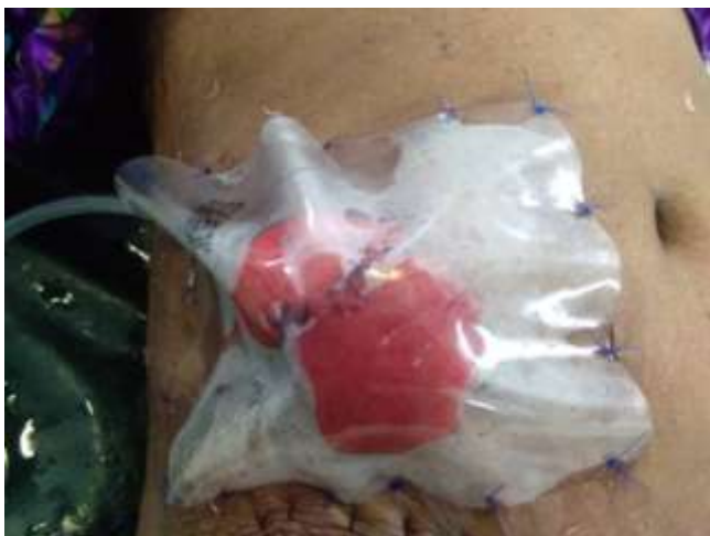
Figure VI: Sterile covering.