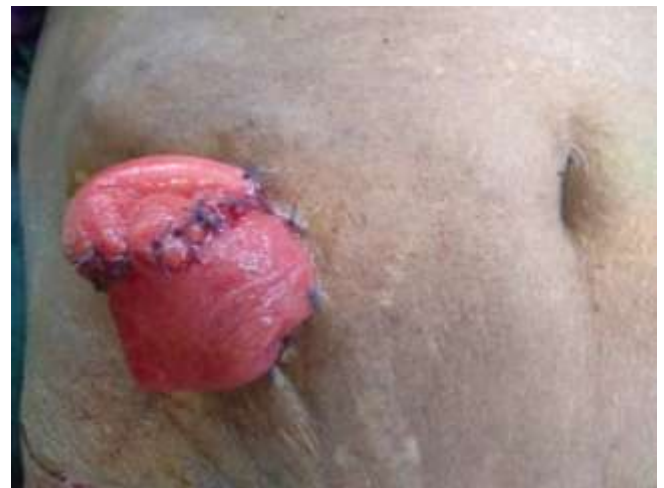
Figure III: Extra-abdominal anastomosis.

Single-layer extra-mucosal or seromuscular anastomosis is done. Only skin fixation is done. Fascial layer fixation (fixation to fascia or peritoneum) is not done.